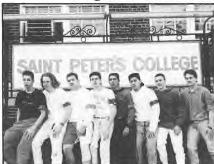
Expansion At St. Peter's