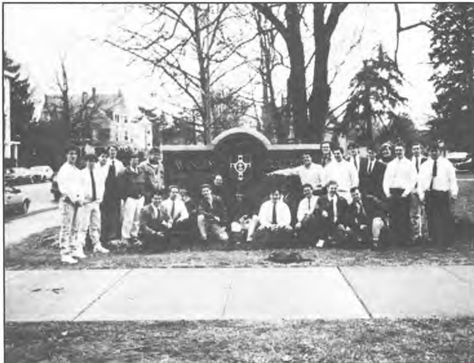
The new brothers of Alpha Phi Delta at Wesley College in Dover, Del. celebrate their initiation.

The expansion boom of Alpha Phi Delta has continued with three new colonies joining the fold in the Spring semester.