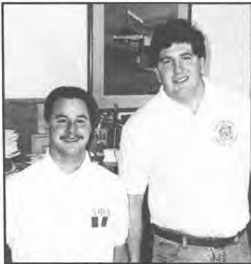
GOLF SHIRTS $15

WITH ΑΦΔ CLOTHING & MORE FROM CENTRAL OFFICE