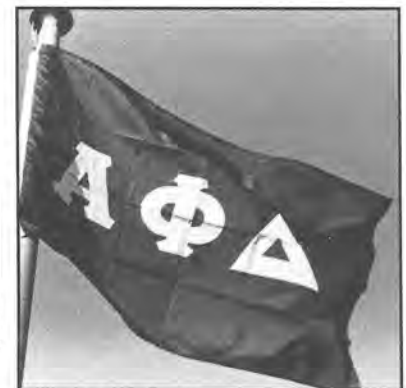
NEW! PURPLE NYLON ΑΦΔ FLAG $50