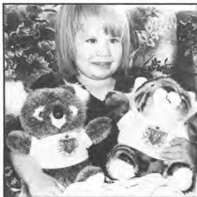
STUFFED ANIMALS $15 (SPECIFY KOALA OR TIGER)