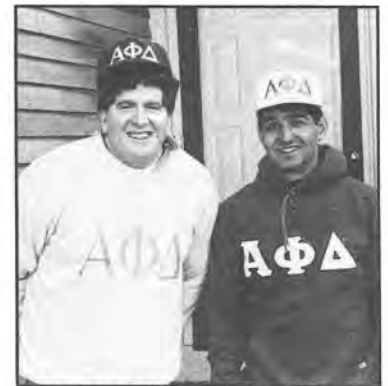
SWEATSHIRTS & CAPS