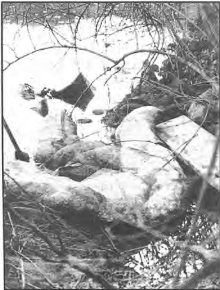
The Gamma Pi Chapter cleaned up the littered Kameron Pond on the Ramapo College campus.